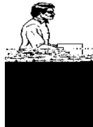
FIGURE VII:1-1. HORIZONTAL MEASUREMENT.